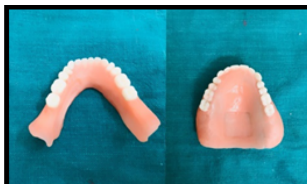
Fig. 3: Slot of desired dimensions prepared