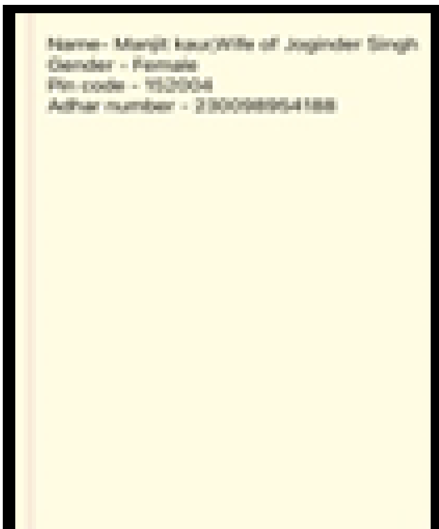
Fig. 6: Information retrieved after scanning code