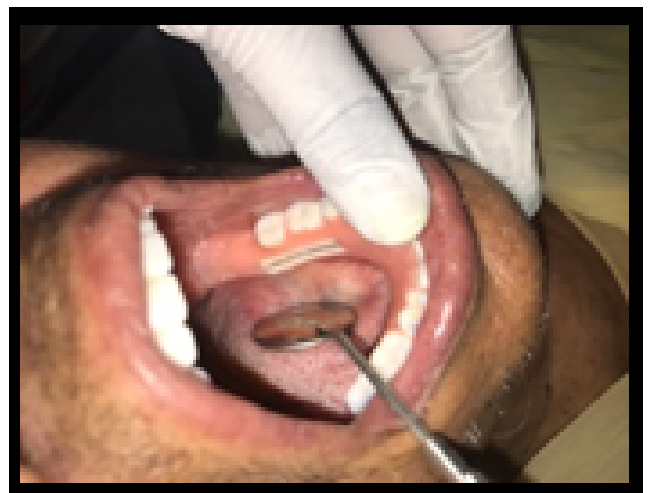
Fig. 8: Mandibular denture insitu

maxillary and mandibular denture on the palatal region and distolingual flange respectively (Figure 9).