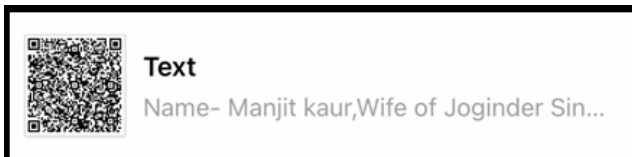
Fig. 5: QR code scanned