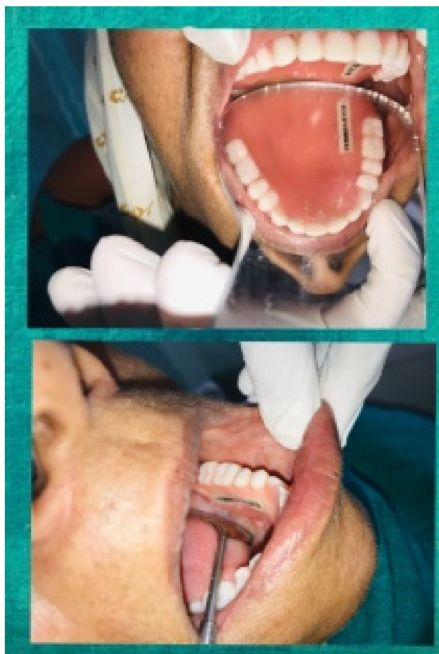
Fig. 9: Definitive prosthesis