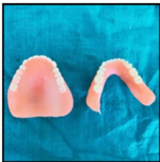
Fig. 1: Prosthesis fabricated