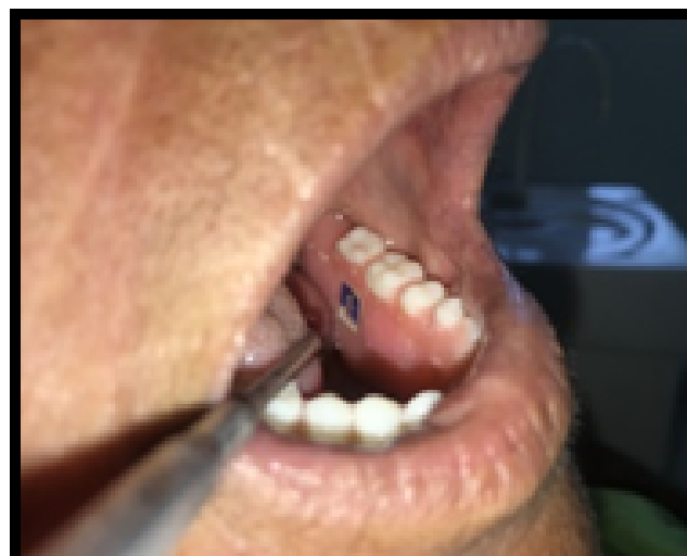
Fig. 11: Mandibular prosthesis insitu

permanent denture labeling or marking can serve as a tool to these problems. Denture markers play an important role in forensic sciences and also in identifying a person in any road traffic accident, bombings, terrorism, air crashes, typhoons, tsunami etc. Denture marking systems can be divided to two broad categories as surface marking and inclusion methods. Surface marking methods involves- Engraving method, Embossing method, Invisible ink method, Fiber tip pen method, Heath's method, Stevensons method, Weckers electro pen method, Laser etching method, Onion skin paper method, Denture bar coding method. Inclusion methods include- Lose inclusion method, Youngs method, Dippenars method, Reasons method, Clear acrylic T bar method, Olivers method, Lenticular card method, Bar coding method, Radio frequency identification tag, Lead foil method, Metallic band according to Swedish guidelines, Photograph inclusion method, Min I Dent method, Data