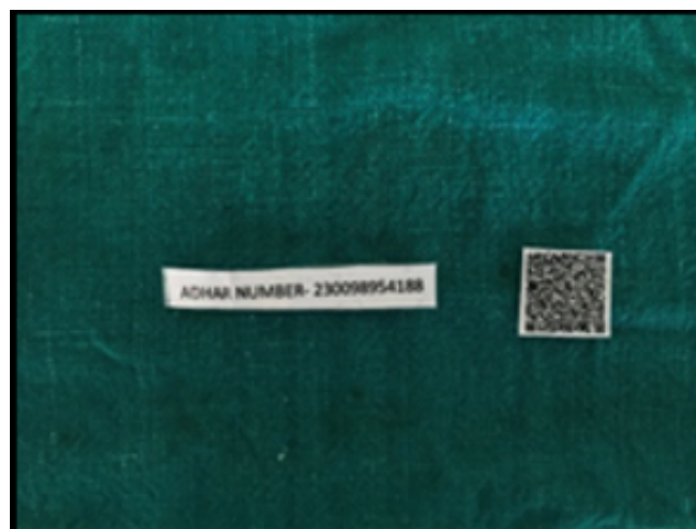
Fig. 2: Aadhaar number and QR code printed on photographic sheet