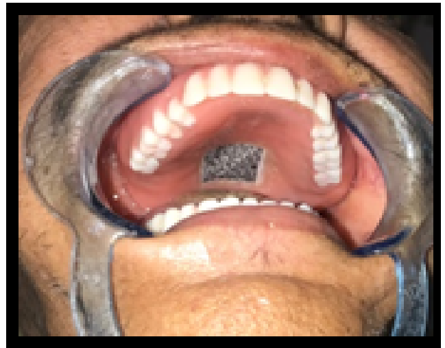
Fig. 7: Maxillary denture insitu