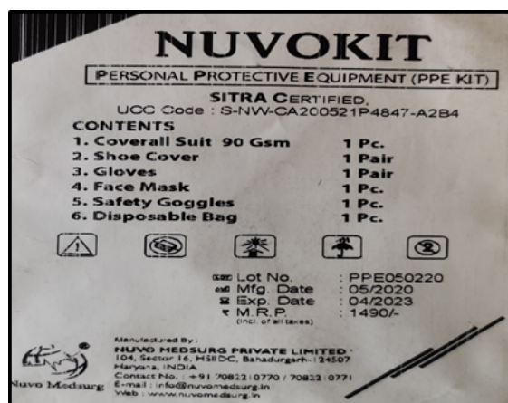
Fig. 4: Personal protective equipment

comparison, mean values shows statistically significant difference between the two groups (Table 3). Comparing two groups (Trusilk & Epiclos), mean healing index scores at 7th day of Group I and Group II was significant (Table 4). The mean values of Group I (Trusilk) and Group II (Epiclos) for Inflammatory cells were recorded which was lesser for epiclos (Table 5). The mean values of Group I (Trusilk) and Group II (Epiclos) for vascularity were recorded which was significantly greater in group I.