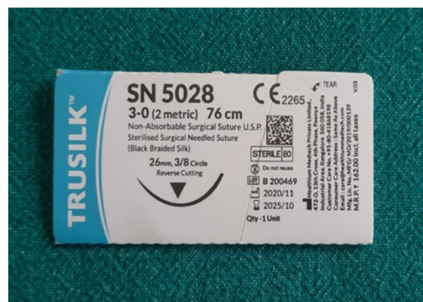
Fig. 3: 3-0 Black braided silk suture