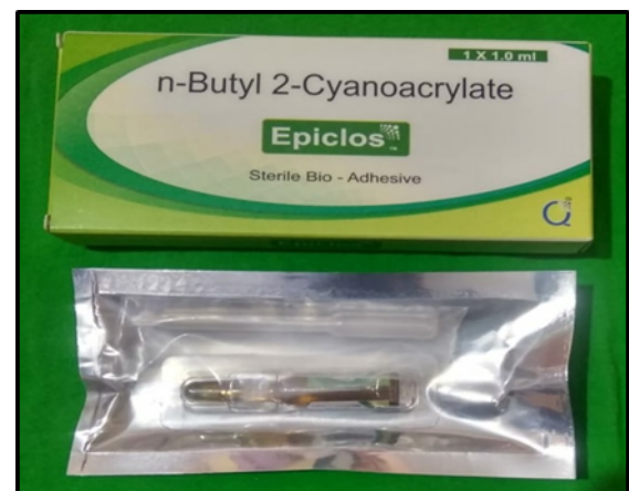
Fig. 2: N-Butyl cyanoacrylate