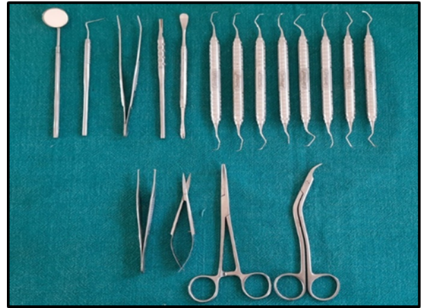
Fig. 1: Armamentarium used

All the parameters scores were statistically analyzed. For intra and intergroup comparison paired and unpaired ‘t’ test was used respectively. In this clinic-histological study mean difference in GI scores on intragroup comparison from baseline to 7th day were statistically significant in both the groups with p < 0.001 . On intergroup comparison, Group II showed lesser mean scores indicating better gingival health with Epiclos (Table 1). PMA index scores on intragroup comparison from baseline to 7th day were statistically significant in both the groups with p < 0.001 (Table 2). On intergroup comparison, Epiclos had lesser mean scores than Silk group. The mean TQHPI scores on intragroup comparison from baseline to 7th day were statistically significant in two groups with p < 0.001 . On intergroup