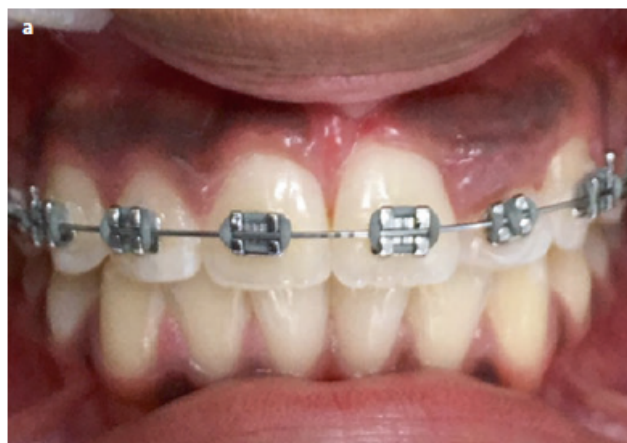
Fig. 2: Preoperative image showing gingival hyperplasia at 22 12

Dental aesthetic procedures like papilla flattening or aesthetic crown can be technically demanding tasks as gingival margins sometimes need very minor recontouring that needs a higher degree of precision that is difficult to be attained with a scalpel blade, regardless of the operator's skill level. Diode lasers offer the accurate incision control because of reduced bleeding and a clear dry field during surgery. 11 (Figures 2 and 3) 11