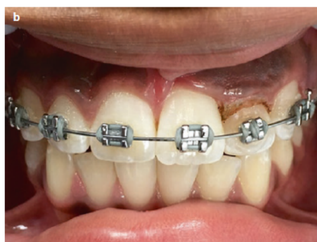
Fig. 3: Post-operative image following local infiltration with 2% lidocaine. Carbonisation is seen at laser gingivectomy site 12