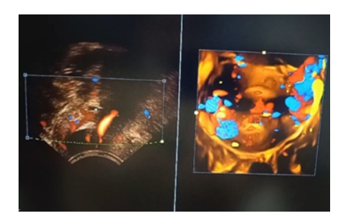
Fig. 4: 2-Dand 3-D image showing peripheral neovascularization