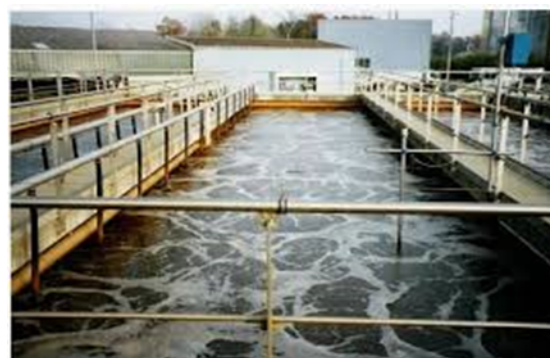
Fig. 3: Aeration zone front view