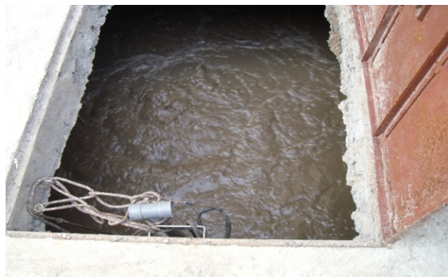
Fig. 1: Stabilized aeration tank