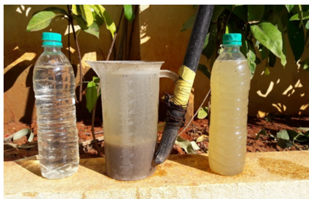
Fig. 2: SSV (Settled sludge volume)

The term mixed liquor suspended solids (MLSS) also can be spelled as Total Suspended Solids (TSS) present in the Aeration zone of a Waste water treatment plant. MLSS test is made to find out the total grams of suspended solids available in the aeration system. This can be determined by using a filter disc which can filter the suspended solids and dried it at 105° C for 1 hour in hot air oven. MLVSS in other hand will help in determining the concentration of volatile suspended solids in the aeration basin. MLVSS is critical in determining the operational behavior and biological inventory of the system. The filter used for MLSS testing is ignited at 550°C for 30 minutes. The weight lost on ignition of the solids represents the volatile solids in the sample. On the whole MLSS is the suspended solids present in the aeration tank which include both organics and inorganic. MLVSS, on the other hand observed to be the volatile portion only, which basically means, this is the portion that are considered to be the microbes. 8