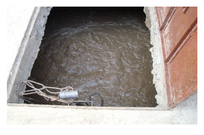
Fig. 1: Stabilized aeration tank

The term mixed liquor suspended solids (MLSS) also can be spelled as Total Suspended Solids (TSS) present in the Aeration zone of a Waste water treatment plant. MLSS test is made to find out the total grams of suspended solids available in the aeration system. This can be determined by using a filter disc which can filter the suspended solids and dried it at 105° C for 1 hour in hot air oven. MLVSS in other hand will help in determining the concentration of volatile suspended solids in the aeration basin. MLVSS is critical in determining the operational behavior and biological inventory of the system. The filter used for MLSS testing is ignited at 550°C for 30 minutes. The weight lost on ignition of the solids represents the volatile solids in the sample. On the whole MLSS is the suspended solids present in the aeration tank which include both organics and inorganic. MLVSS, on the other hand observed to be the volatile portion only, which basically means, this is the portion that are considered to be the microbes.<sup>8</sup>