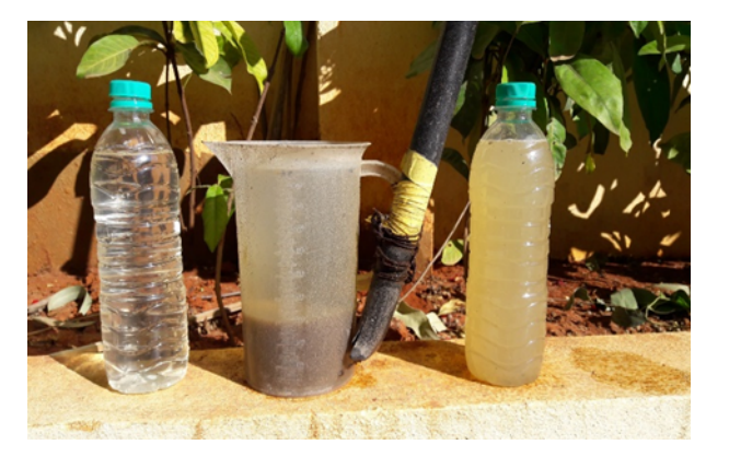
Fig. 2: SSV (Settled sludge volume)