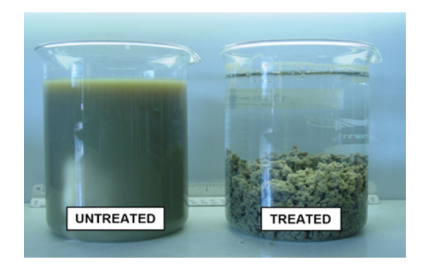
Fig. 4: Settled sludge