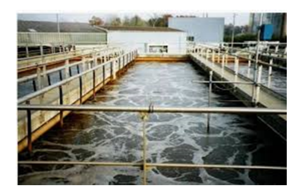
Fig. 3: Aeration zone front view