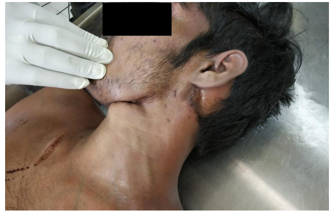
Fig. 2: Showing ligature mark