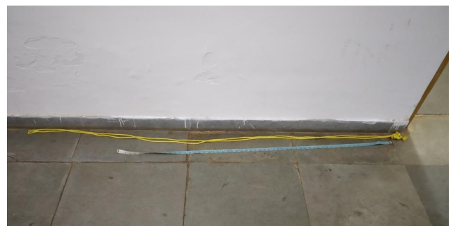
Fig. 4: Ligature material

It was a plastic rope having twisted spiral pattern and of yellow colour produced in two pieces (Figure 4). Total length is about 214cm keeping knots intact. The twisted circumference of each rope is 1cm and both fiber ropes jointly has twisted circumference of 2cm.