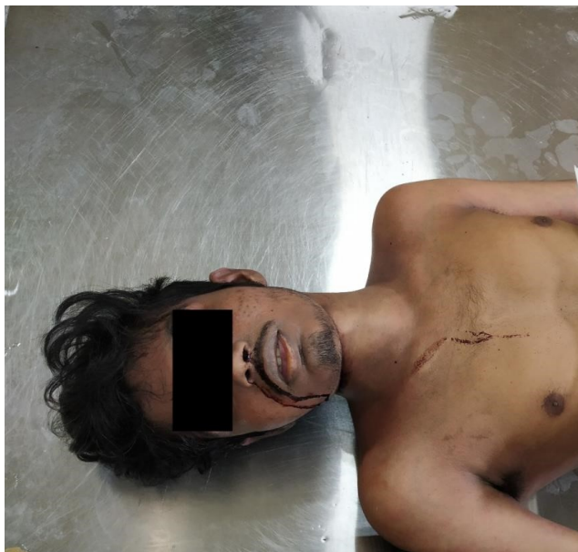
Fig. 1: Showing ligature mark at neck

Ligature mark in form of deep grooved pressure abrasion and of reddish brown colour was present around the neck (Figures 1 and 2). It starts at a point 2cm below the left angle of mandible and continues forward to front of neck and crossing over and above thyroid cartilage to right side of neck and running upward and backward to a point 6cm below the right angle of mandible and then continuing backward to hairline and disappears at a point which is 6cm below left mastoid. Circumference of pressure abrasion is 38cm and maximum breadth is 2cm at left side of neck at the mastoid region. In internal findings- Neck- skin under the ligature mark was parchmentized and tissues were intact (Figure 3). Lungs were congested and edematous and other than this, no other findings were significant.