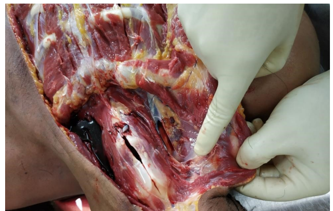
Fig. 3: Showing neck dissection findings