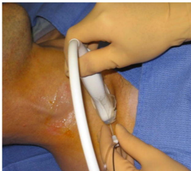
Fig. 1: Ultrasound probe position on neck for supraclavicular approach of brachial plexus block