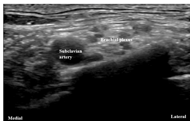
Fig. 3: Ultrasound image of needle approaching brachial plexus and spread of local anaesthetic agent from supraclavicular approach

it was measured every 30 minutes till 4 hours, every 2 hours till 12 hours and then every 6 hourly till 24 hours after the surgery.