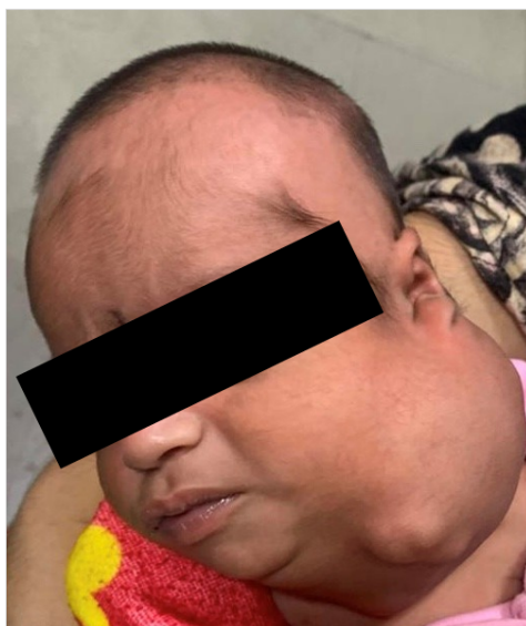
Fig. 1: Large lymphangioma covering left neck-preop