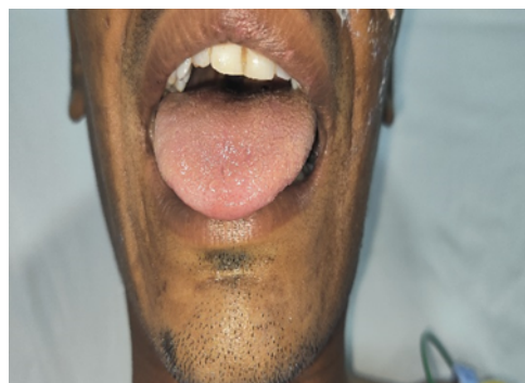
Fig. 1: Photo of patient showing restricted mouth opening.

with inj Propofol 120 mg iv + inj Loxicard 2cc and the patient was given bag mask ventilation with 100% o 2 . Inj succinylcholine 100 mg IV was given after ventilation was continued for 60 seconds and laryngoscopy was attempted but was abandoned as the patient went into masseter spasm.