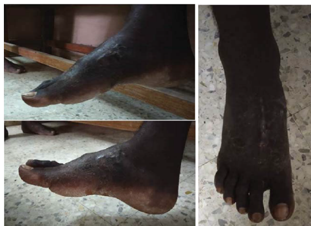
Fig. 12: Case 2: Follow up clinical pictures after 12 months