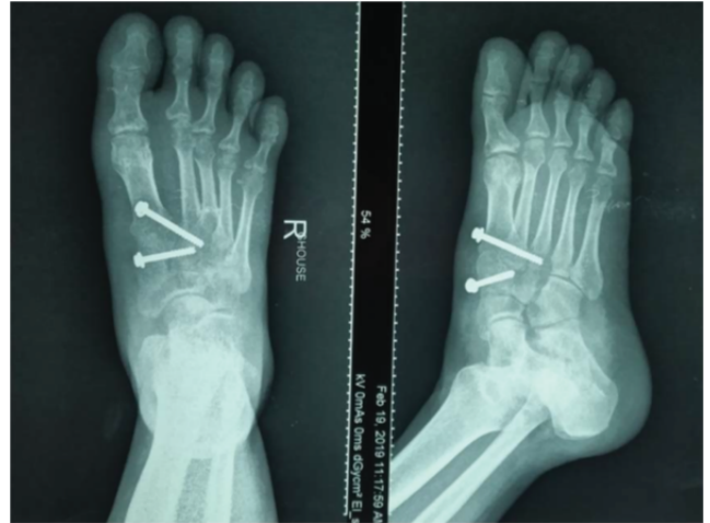
Fig. 6: Case 1: Immediate post-operative x-ray