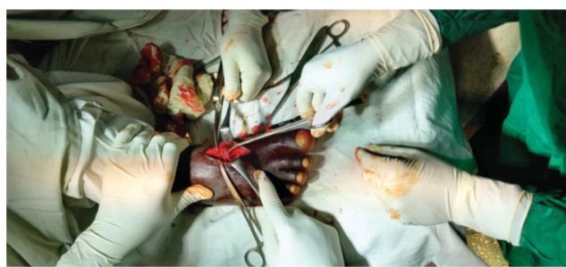
Fig. 2: Exposing the fracture site to remove any intervening bony fragments