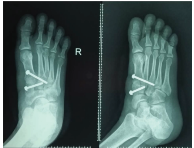
Fig. 7: Case 1: Follow up x-ray after 12 months

period November 2018 to October 2020. The following observations were made in the present study.