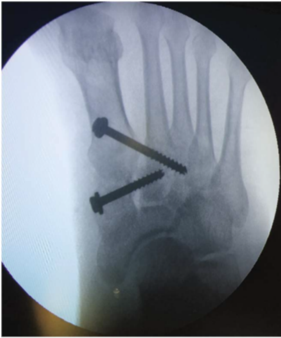
Fig. 4: Final C arm image after fixing the Lisfranc's fracture dislocation