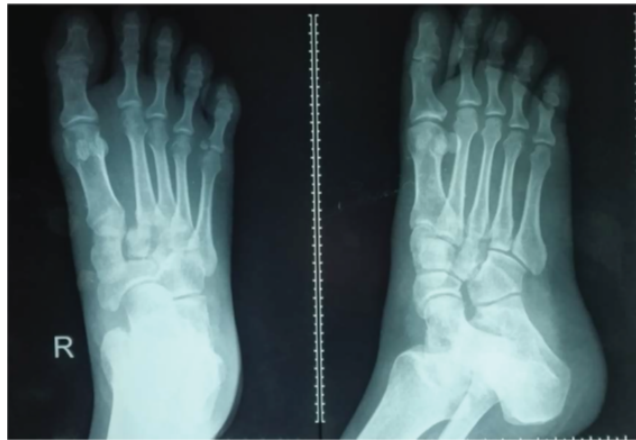
Fig. 5: Case 1: Pre-operative x-ray