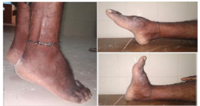
Fig. 8: Case 1: Follow up clinical pictures after 12 months