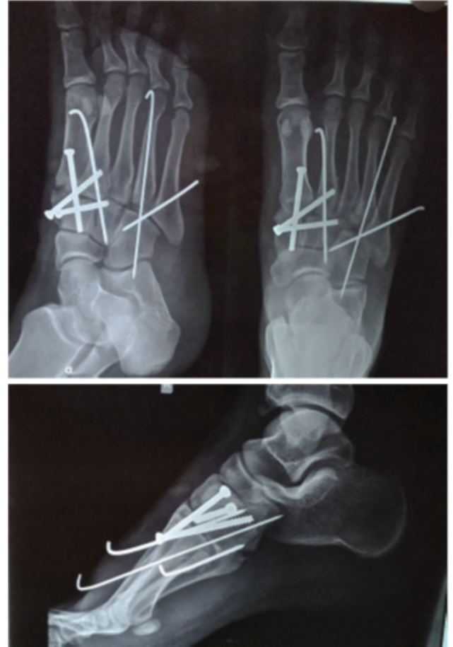
Fig. 10: Case 2: Immediate post-operative X-ray

In our study among 30 patients, the youngest was 18 years and the oldest was 60 years old. Mean age being 34.67 years. The highest incidence of 11 patients (36.67%) was noted in the 31 to 40 years age group (4th decade). The lowest incidence of 2 patients (6.67%) was noted in the older age group of 51 to 60 years.