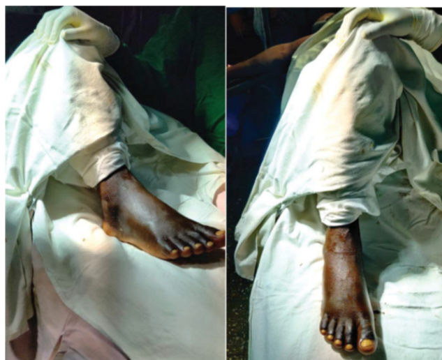
Fig. 1: Draping and positioning of the patient

The study consisted of 30 cases of Lisfranc's Fracture Dislocation treated by Surgical Procedure during the