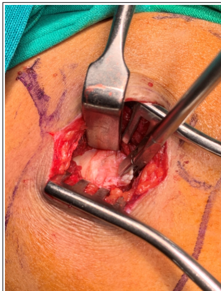
Figure 1: Cuff tear.

The rotator cuff tear was identified and mobilized to bring the edge to the footprint