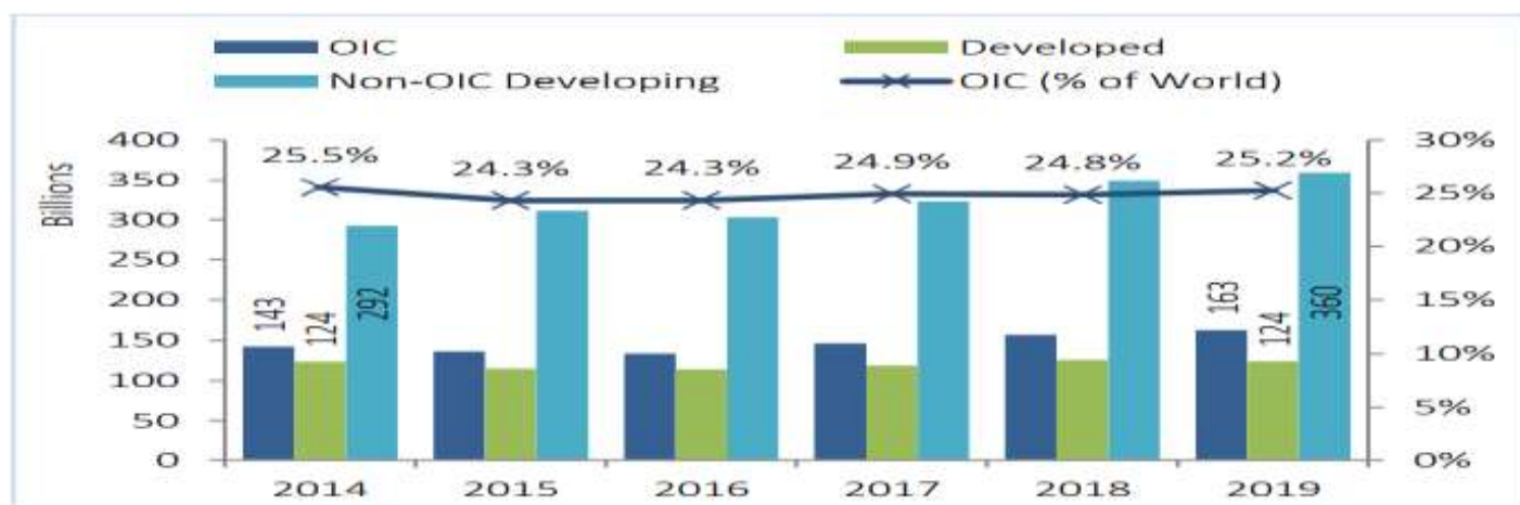
Figure 1 Remittance Growth in OIC Countries

Saiz, Dridi, Gursay, & Bari, (2019). This can be proven in figure 1 below: