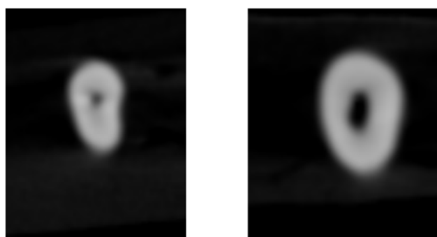
Fig. 4: Pre and post operative image at 5 mm from the apex – ProTaper gold