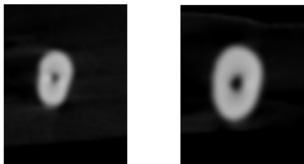
Fig. 3: Pre and post operative image at 5 mm from the apex – Trunatomy

comparison between two groups at 5mm and 7mm for canal centering ability were not statistically significant.