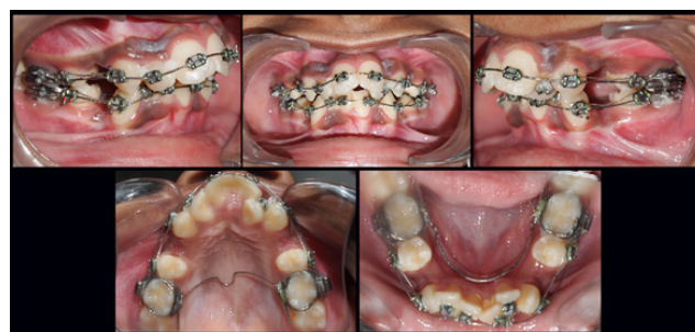
Fig. 3: Banding and bonding of upper and lower arch (0.012 NiTi wire engaged)

All four 1 st premolars were extracted. The first molars were banded and the remaining teeth were bonded using 0.022" Pre-Adjusted Edgewise Appliance (MBT Mini master series, American Orthodontics). Upper trans-palatal arch and lower lingual arch were inserted for augmenting molar anchorage.