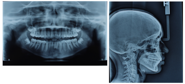
Fig. 7: Post treatment radiographs