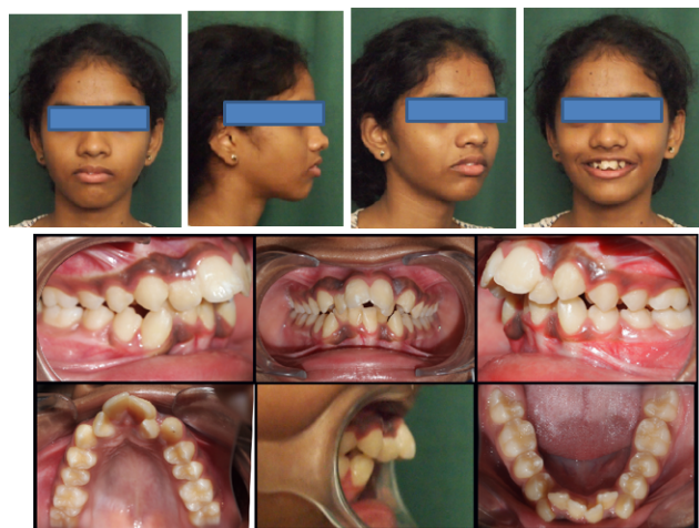
Fig. 1: Pre-treatment photographs

the temporomandibular joint. Her growth status was CVMI stage 4 and SMI stage 11 indicating a small amount of adolescent growth remaining. Cephalometric analysis indicated a class II skeletal base due to orthognathic maxilla and retrognathic mandible, vertical growth pattern and proclined upper incisors.