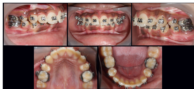
Fig. 4: Intraoral photographs after 0.019X0.025 SS wire stage

Initial alignment wires were progressed from 0.014 NiTi, 0.016 NiTi, 0.018 SS, 0.017 x 0.025" NiTi to finally 0.019 x 0.025" SS wire. The extraction spaces were almost completely closed by the alignment of anterior teeth with only 2 mm of space remaining in the upper arch on both sides.