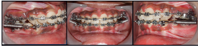
Fig. 5: Insertion of forsyus FRD

then done using settling elastics on 0.016 SS wire in the upper and lower arches.