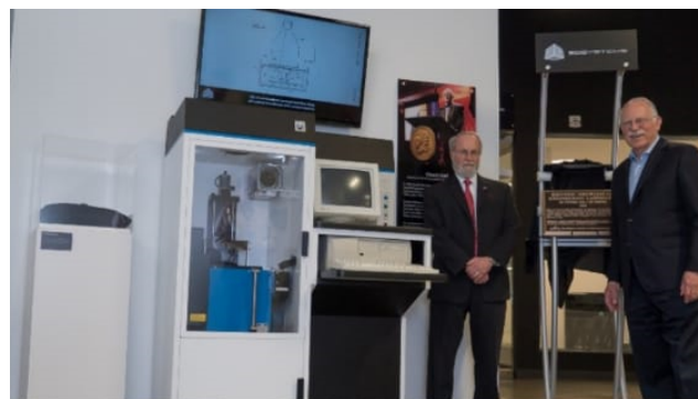
Fig. 1: Chuck Hull with the first ever 3D printer, the SLA-1 28

A study was conducted to determine the possibility of implementing a fully digital workflow clinically with individually designed and three-dimensional printed (3D-printed) brackets. This study concluded that it is possible to perform treatment with an individualized 3D-printed brackets system by using the proposed fully digital workflow. 27