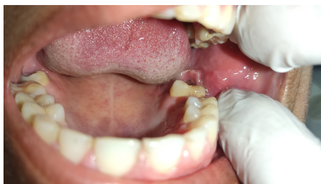
Fig. 1: A proliferative erythematous lesion measuring approximately 2*2 cm

The intraoral examination revealed a proliferative lesion measuring approximately 2*2 cm and was erythematous appearance. It extends Anteroposteriorly, from the distal part of the 17 to the posterior aspect maxillary tuberosity and mediolaterally, it was extending from buccal aspect of 17, 18 to lingual aspects of 17, 18 region. The border of the lesion was everted (Figure 1).