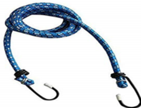
Fig. 1: Bungee cord - Elastic or rubber cord with metallic hooks at each ends