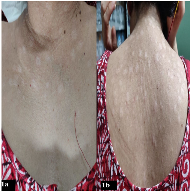
Fig. 1: a: Multiple well defined round skin colored to hypopigmented plaques distributed over neck; b: Lesions over upper chest

Second trimester ultrasonography (USG) reported no gross congenital anomalies in fetus. She had multiple well-defined hypopigmented plaques over the neck, chest, upper back and forearm, suggestive of secondary syphilis (Figure 1 a,b). Hence, she was treated with single dose of benzathine penicillin G 2.4 million units intramuscularly.