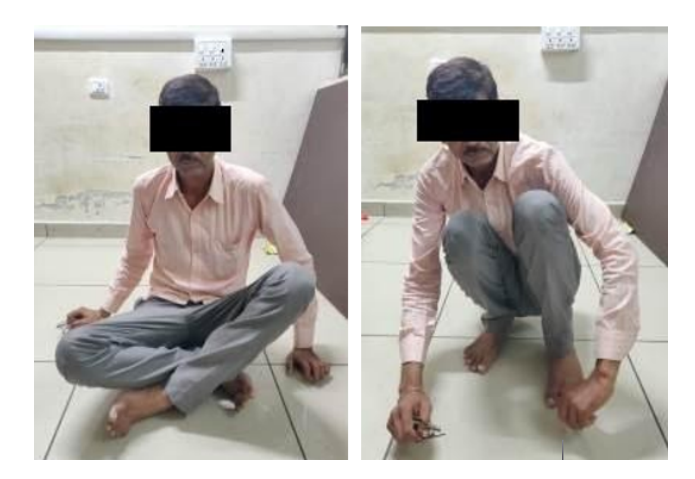
Fig. 3: Clinical pictures at 18 weeks