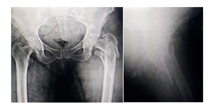
Fig. 6: Pre-ope