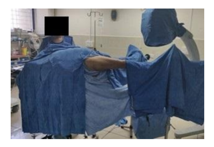
Fig. 4: Patient positioning in OT