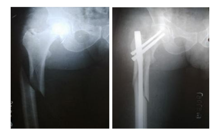
Fig. 1: Pre-ope & Post-ope

The implant consists of a Proximal femoral nail, two proximal screws (8 mm and a 6.5 mm femoral neck screw), two 4.9 mm distal locking screws and an end cap. The proximal diameter of nail is 14 mm. This increases the stability of the implant. The medio-lateral valgus angle is 6^* , which prevents varus collapse of the fracture even when there is medial comminution. Proximally, it has two holes: the distal one is for the insertion of a 8 mm neck screw, which acts as a sliding screw and the proximal one is for a 6.5 mm hip pin, which helps prevent rotation. The distal diameter is tapered upto 09 to 12 mm, which also has grooves to prevent stress concentration at the end of the nail. Distally, the nail has two holes for insertion of 4.9 mm locking screws, of which one is static and the other is dynamic allowing dynamization of 5 mm.