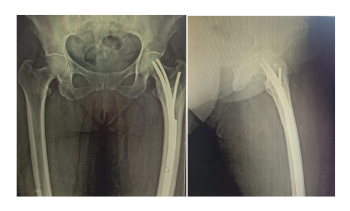
Fig. 8: At 18 weeks follow-up