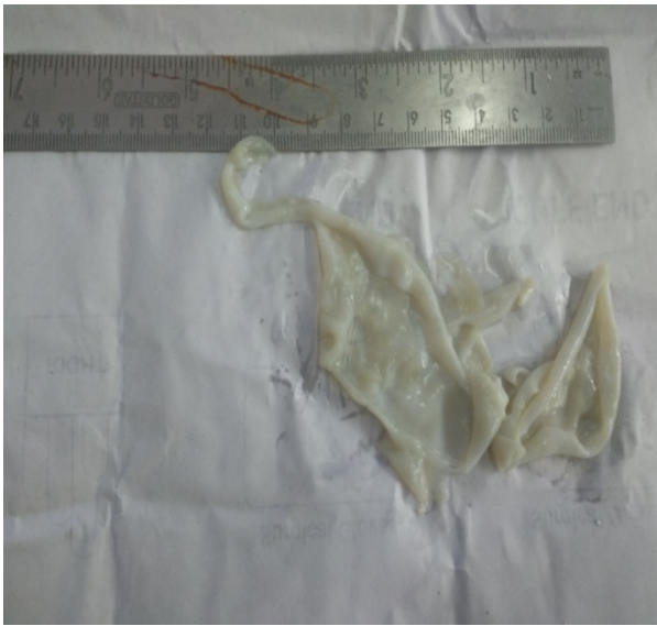
Fig. 1: Gross: pearly white cyst membrane

cyst in segments IV b and VI of liver measuring (24.7 x26.7) mm and (18.4x18.6) mm along with the splenic hydatid cyst measuring (6.4x7.7x6) cm with surrounding rim of fluid suggestive of pericyst fluid rupture with thin overlying parenchyma and splenomegaly. It was treated with enucleation of hydatid cyst with omentopexy with drainage of residual cavity and the diagnosis was confirmed on histopathological examination of cyst membrane. Pearly white cyst membrane was received in the department of pathology. Gross picture is shown in Figure 1 and microscopic examination showed endocyst with scolices as in Figure 3. A separate soft tissue was also received which on microscopy revealed pericyst as shown in Figure 2.