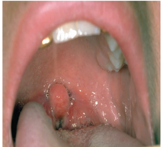
Fig. 2: A pseudomembrane 4

Diagnostic tests include throat culture.