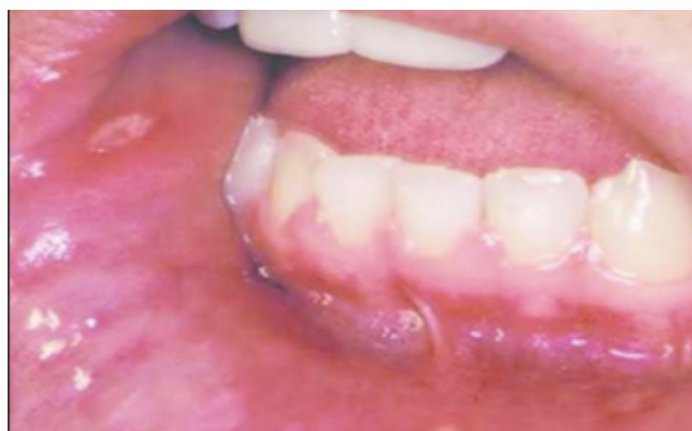
Fig. 1: Aphthous stomatitis