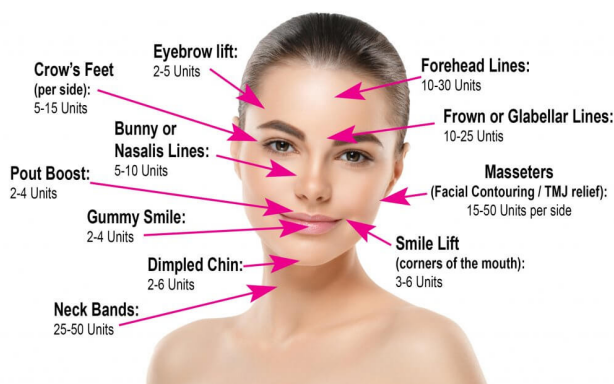
Fig. 3: Site for botox injections