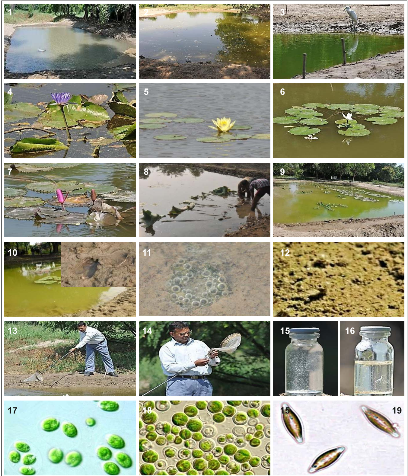
Photo plate II: 1. Poured water was muddy, 2. Fresh cow dung and organic compost was added, 3. By 28.09.2015, water turned green due to over growth of phytoplankton and attracted avian, 4. to 7. Initially, introduced 4 species of Nymphaea viz. N. caerulea Sav., N. Mexicana Zucc., N. pubescens Wild. and N. rubra Roxb. ex Andrews in row of different colours, 8. Further introduced 7 individuals of Nymphaea colorata Peter (Voilet), 9. Colour of water changed green to yellowish-greenish, 10. Foot marks of Nilgai and birds, 11. Air bubble formed at bottom, 12. Air bubble and hose of Chironomids/ Tubifex , 13. & 14. Sampling of plankton, 15. & 16. Preserved Plankton samples, 17. Chlamydomonas reinhardtii P.A. Dang, 18. Chlorella vulgaris Beijerinck and 19. Navicula cryptocephala Kutz.