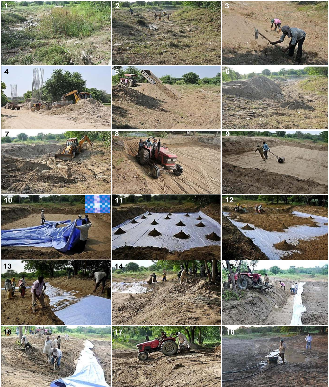
Photo plate I: 1. Full of weed in non-functional water body, 2. Cleaned by de-weeding, 3. Uprooting stumps, 4. Picking of bentonite mixed soil from excavated site of New Metro Route, 5. Dumping of bentonite mixed soil at proposed site of water body, 6. Piling of brought soil, 7. Leveling by JCB, 8. Leveling by Tractor, 9. Manually making firm surface by roller, 10. Laying of a semi-permeable single sheet all along excavated land, magnified view of sheet is in inset, 11. & 12. Laying of soil up to 2 ft over laid semi-permeable sheet, 13-16. Embankment work under progress, 17. Leveling by Tractor over bank and bottom of water body and 18. Pouring water.