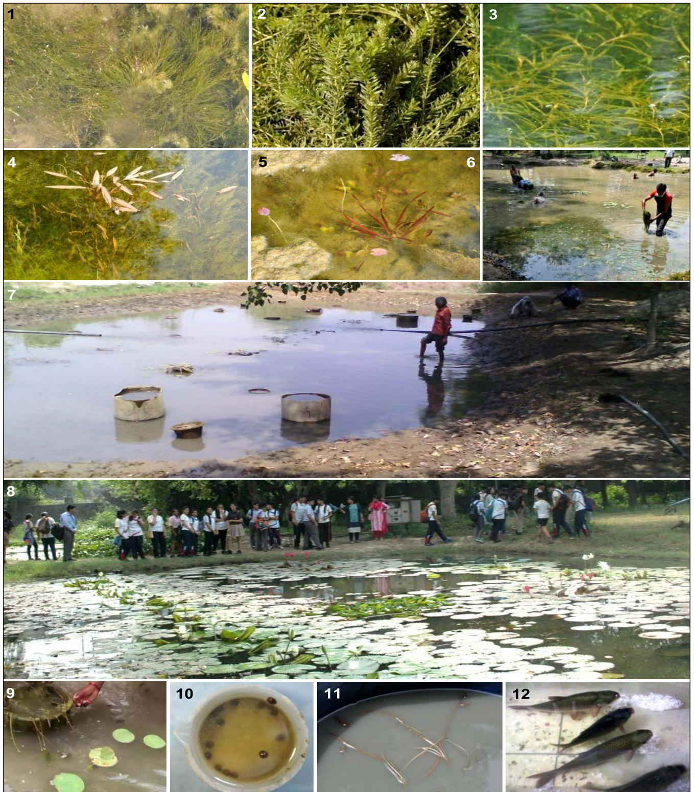
Photo plate IV: Macrophytes: 1. Ceratophyllum demersum L., 2. Hydrilla verticillata (L.f.) Royle, 3. Potamogeton crispus L., 4. Potamogeton nodosus Poir., 5. Vallisneria spiralis L., 6. Cleaning/de-weeding of developed water body after 1 year as it was eutrophicated by over growth of above macrophytes and phytoplanktonic algae, 7. Re-watered and planted all previous species in row of colours, 8. Students were detailed about aquatic flora and fauna, 9. Saplings of Nelumbo nucifera Gaertn. introduced, 10. Seeds of Victoria amazonica (Poepp.) J.C. Sowerby kept in water for germination, 11. Developed seedlings of V. amazonica and Fish: 12. Two; each adult of Labeo catla F. Hamilton and Labeo rohita F. Hamilton also introduced in water body.