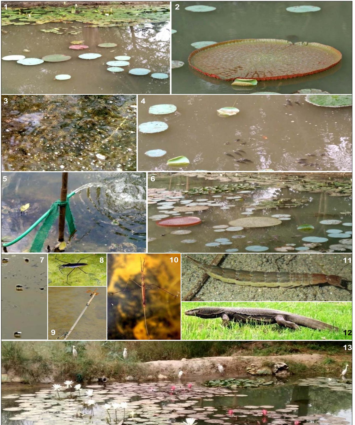
Photo plate V: 1. Thinning of over growth of species of Nymphaeae undertaken for developing saplings of Nelumbo nucifera as well as V. amazonica , 2. Developing leaf of V. amazonica , 3. Spawn and Fry of introduced fishes. 4. Fingerlings of fishes near water surface, 5. Aeration started for oxygenation of water for breathing in different stages of fishes, 6. All plants growing very well, 7. Flies, 8. Pond Skater, 9. Dragonfly, 10. Water Stick Insect, 11. Larvae of Cybister sp., 12. Water monitor and 13. Group of Great white Heron.