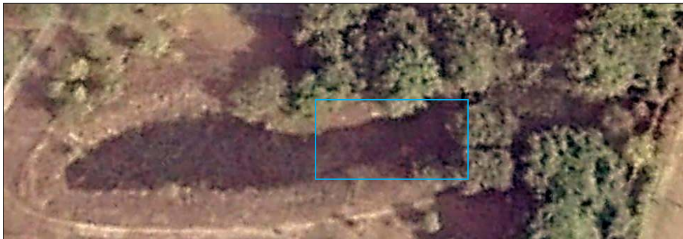
Fig. 1: New developed water body in almost half part of the non-functional water body No. 5 at BGIR.

Initially, cleaning/de-weeding and uprooting of weedy herbs/shrubs, etc. from proposed area was undertaken. The soil spread/heaped in and around piers of new Metro Line under Phase-II was filled up to 5 ft., leveled and firm smooth surface of bottom was made by tractor and metallic roller. Then, a laminated two-ply semi-impermeable sheet at a depth of approx. 4-5 ft. was laid over ground and slant of the bank. Further, to get all along desired depth of 3 ft. in water body, 2 ft. thick layer of bentonite mixed soil was again spread all over, leveled and surface was made firm and smooth.