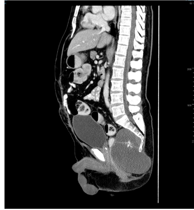
Fig. 2: CT ABDOMEN. presacral mass.Se106.Img1

Sacrococcygeal teratoma though represents the most common congenital tumor in neonatal group, Its occurrence in adult age group is uncommon with low incidence of about 10% with predilection for male sex male to female ratio being 4:1.^3 Almost 90% of these tumors are detected in