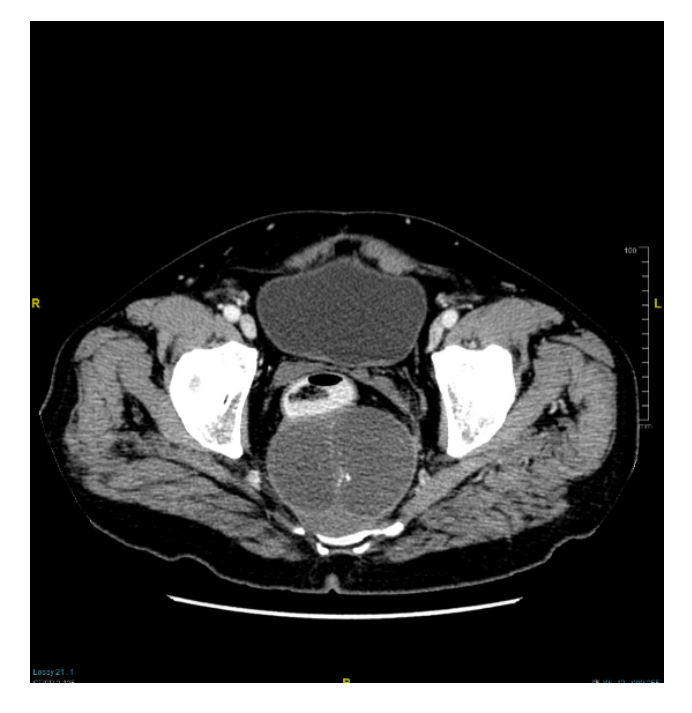
Fig. 1: CTABDOMEN.mucin,enhancing soft tissue post.Se107.Img1

In our case, due to radiological suspicion of infected dermoid cyst, the pre-operative serum tumor levels were not done and surgical excision was planned. The patient received adjuvant therapy and is disease free at postoperative interval of one year.