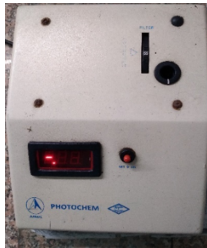
Fig. 4: Photometer (AIMIL)