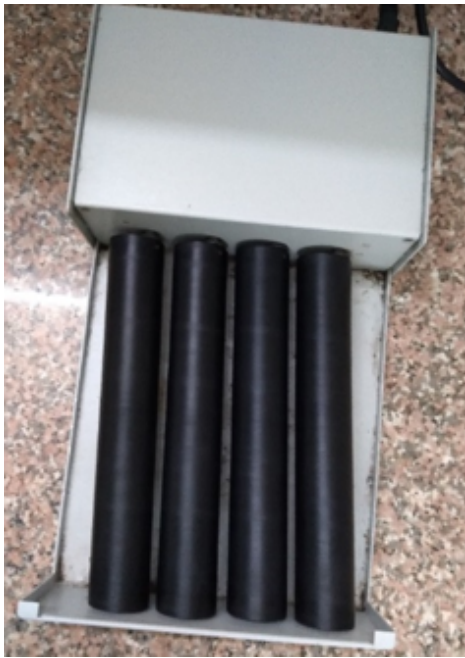
Fig. 1: Blood Shaker