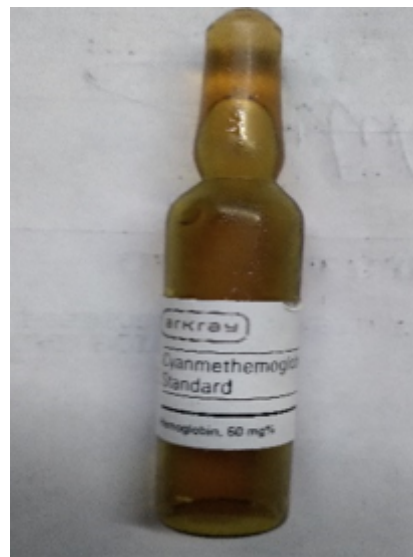
Fig. 5: Hb Standard for photometer

standard calibrator. 16,17 Periodic standards (controls) must be run to maintain accuracy both in manual & automated method. Hemoglobin estimation by automated cell counters is the next best method. 18 There is a significant and positive correlation between the manual and the automated method. 19 For accuracy proper sample collection and proper technique is very important. 20