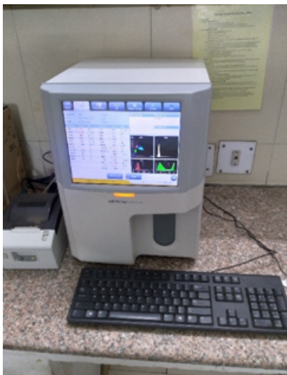
Fig. 2: Mindray Cell Counter BC 5150