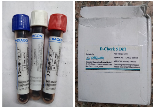
Fig. 3: Hb Controls of Cell Counter