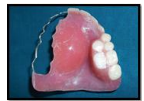
Fig. 2: A guide plane prosthesis

to compensate for the deviation that can provide a surface against which the artificial teeth of the residual segment can occlude.