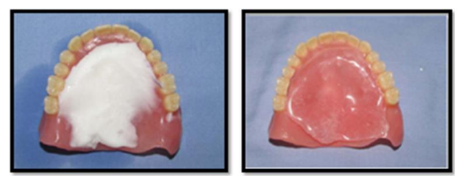
Fig. 1: Palatal augmentation prosthesis

A Palatal augmentation prosthesis is beneficial for the rehabilitation after glossectomy of patients with head and neck cancer. Its use enables patients to perform compensatory movements of the tongue in relation to the surrounding structures, movements that are essential for articulation and the oral preparatory and oral phases of deglutition. The prosthesis is fabricated by adding bulk of acrylic on the palatal aspect of the patient which is moulded according to functional movements of the patient. This prosthesis in conjunction with a speech therapist and pathologist will aid to improve the speech of the patient to the utmost level.