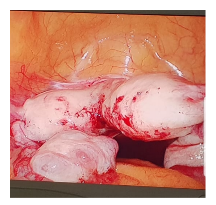
Fig. 2: Laparoscopic view showing bicornuate uterus with two separate horns and tubes

Laproscopy for the treatment of Bicornuate uterus is a safe option. Initially it was used for diagnostic purpose only but in the hands of skilled surgeons it is considered an alternative to abdominal Strassman metroplasty. The key advantage of laparoscopic procedure is less incidence of adhesion due to minimial tissue handling.<sup>7</sup> Adhesions are further minimized by use of liquid agents like 4% Icodextrin solution or spraying with hydrogel barriers.<sup>8</sup> However, good suturing skills are required for ensuring complete hemostasis in laproscopy. Adequate care may be taken to ensure that the myometrial edges are not sutured under tension, as it is prone for hematoma formation. It also increases the chances of necrosis formation in the uterine