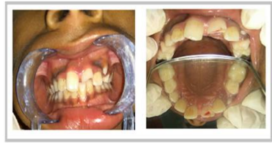
Figure 1: A: Preoperative clinical photograph, B: Complicated crown fracture involving enamel, dentin and exposing pulp.

# 15 (Dentsply/Maillefer, Ballaigues, Switzerland) based on the pre-operative radiographs [Figure 3].