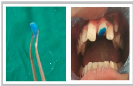
Figure 4: Etching two broken tooth fragments with 37% phosphoric acid.

After that, the canals were dried and filled with size F2 gutta-percha cones (Dentsply Ind. e Com. Ltda., Petrópolis, Brazil) and AH Plus sealer cement [Figure 5A]. Now, the pulp chamber was partially filled with restorative Glass Ionomer Cement. Then, the tooth fragment and the remaining tooth structure were prepared for bonding. An enamel bevel was prepared all around the remaining tooth structure as well as the fractured margin of the segment and the fragment was reapproximated to check its fit. An additional internal dentinal groove was also prepared within the dentine of the fractured fragment part. Acid etching of the access cavity and the approximating surfaces of the two segments were carried out for 20 s with 37% phosphoric acid.