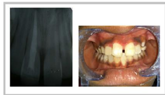
Figure 5: A: Post operative radiograph, B: Post operative clinical photograph.

With the advent of rotary endodontics, ProTaper files are commonly in use because when compared to other file systems, it has changing percentage tapers over the length of its cutting blades that serves to significantly improve flexibility, cutting efficiency, and safety. It's convex, triangular cross-section enhances the cutting action while decreasing the rotational friction between the blade of the file and dentin. The ProTaper Shaping files are allowed to be used like a brush, to laterally and selectively cut dentin on the outstroke and passively follow the glide path to optimize safety and efficiency. [12] Flexible files rotating in a curved canal require unimpeded space, and widening this space from the crown down seems the logical solution.