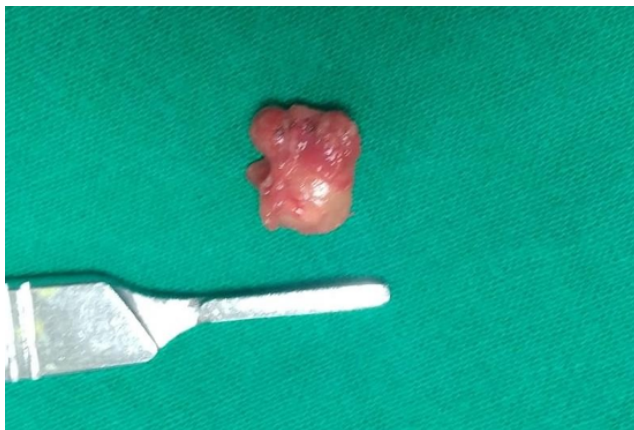
Fig. 1: Excised lymph node

She was treated with complete course of Diethylcarbamazine and did a follow up USG of abdomen, which showed complete resolution of right sided hydrosalpinx.