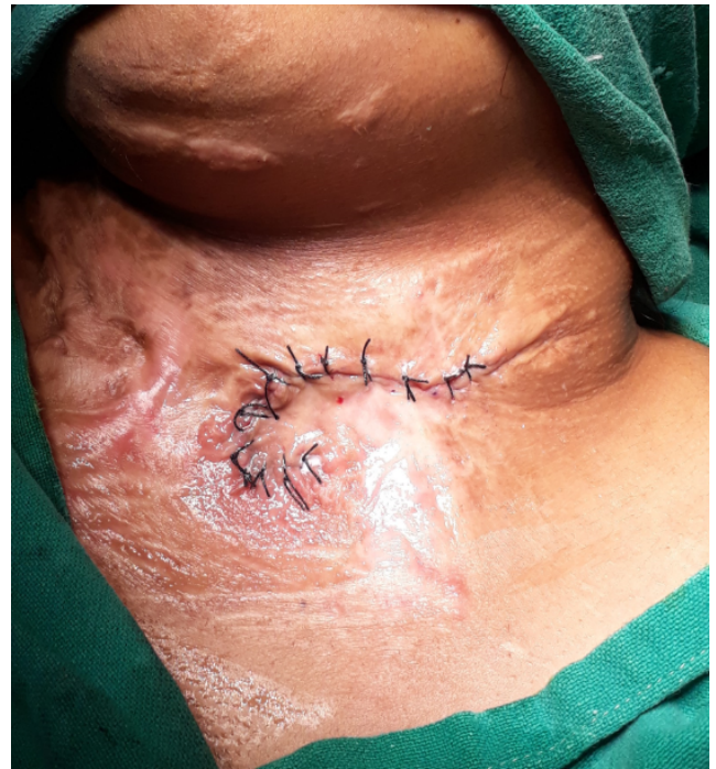
Fig. 4: Final picture after suturing flaps in position.