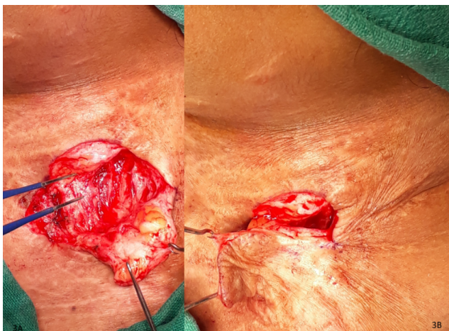
Fig. 3: Intraoperative clinical picture showing fasciocutaneous pivot flap being raised (3A) and flap rotated and transposed to suture (3B).