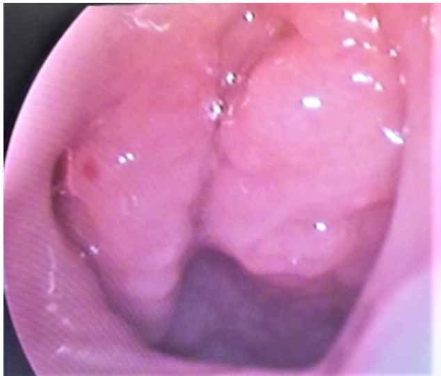
Fig. 3: Endoscopic view of adenoid

Grade I: adenoid tissue filling 1/3rd. of the vertical height of choana. Grade II: adenoid tissue filling up to 2/3 rd of the vertical height of choana. Grade III: from 2/3rd to nearly all but not completely filling the choana. Grade IV: complete choanal obstruction as shown in Figure 3.