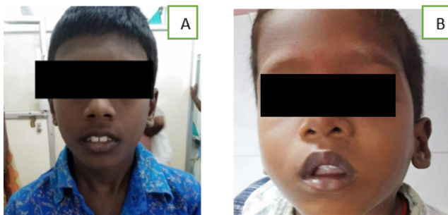
Fig. 1: A,B:Depicting adenoid facies

Each of these values was then added together to give a total symptom score out of 16; The symptomatology score for each patient was rated into four grades, as follows: Grade I: 1-4 (mild); Grade II:5-8(moderate); Grade III:9-12(moderately severe), Grade IV:13-16(severe) -Figure 1 A,B