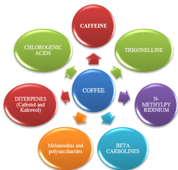
Fig. 1: Bioactive compounds present in coffee

neural function attributed to energy balance. Caffeine is rapidly absorbed through the gastrointestinal (GI) tract and moves through cellular membranes with the same efficiency as when it is absorbed and circulated to tissue. Caffeine is metabolized by the liver and results in metabolites like paraxanthine (1,7-dimethylxanthine), theophylline (1,3-dimethyl-xanthine), and theobromine (3,7-dimethyl-xanthine) by the action of an enzyme.