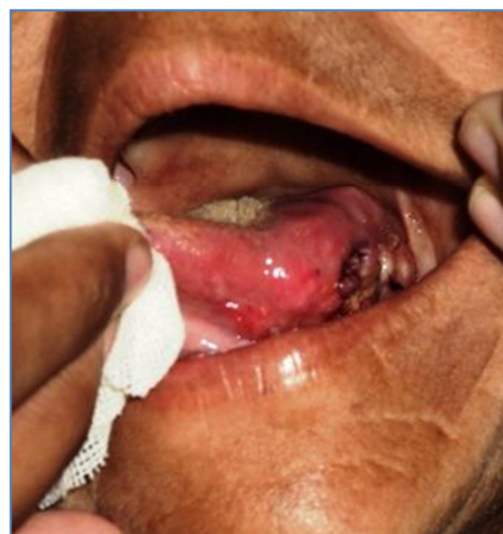
Figure 1: Intraoral view showing ulcerative lesion on lateral border of tongue.

A 38 year old male patient came to the department of oral and maxillofacial pathology with a chief complaint of slight pain and discomfort in the tongue since 6 months. Patient gave a history of tobacco chewing since 5 years, 8-10 gutkha packets per day and consumption of alcohol once a week. Examination revealed an ulcerative lesion over left lateral border of the tongue measuring approximately 3x2 cm. The margins of the lesion were irregular and indurated [Figure 1]. His medical and family history was insignificant. He did not had any difficulty in mouth opening and adjacent teeth were normal without any sharp edges. Lymph nodes were not palpable.