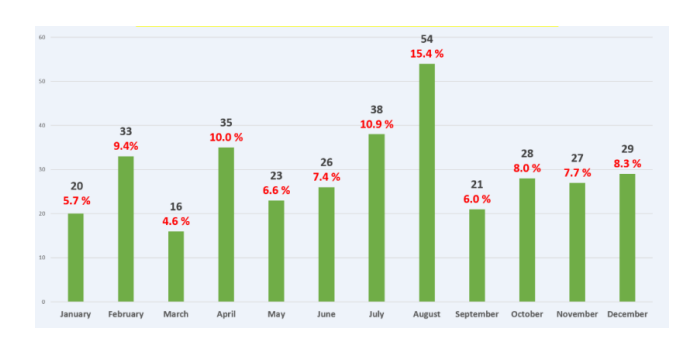
Graph 2: Depicts Month frequency of repeat FNAC – Month wise