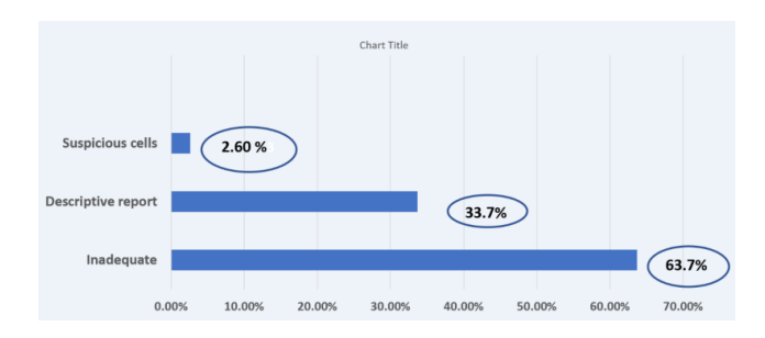
Graph 3: Depicts reasons for repeat FNAC