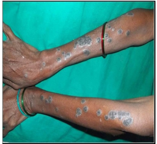
Fig. 1: Clinical picture of lichen planus showing well defined hyperpigmented plaques with violaceous halo.

Histopathologically, common features were in psoriasis: Hyperkeratotic epidermis with psoriasiform hyperplasia, elongated rete ridges with suprapapillary thinning. Munro Microabscesses were seen in 25% cases. Scattered inflammatory cells and edema were also noted in 12 and 8 cases respectively (Figures 2 and 3). All four cases of Pityriasis Rosea showed epidermal acanthosis and perivascular dermal infiltrates. Slight spongiosis and Extravasated erythrocytes in the dermis extending up to epidermis were seen in 3 cases (Table 4).