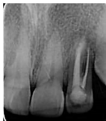
Fig. 3: One year follow-up radiograph of #22 showing healing of peirapical lesion

one regular & extra accessory root. There were cases of maxillary lateral incisors with two roots 5,15–19 reported, but two rooted maxillary lateral incisor, one root with open apex and another normal root has never been reported in the literature. Since one mesial and one distal root was clearly seen in the IOPA radiograph, we did not find the need for CBCT imaging. One of the challenges faced in the treatment of open apex is lack of apical stop, thus achieving a good apical seal is difficult. Apexification is formation of an apical calcified barrier consisting of osteocementum or other bone like tissue. 20 Materials such as calcium hydroxide, Mineral Trioxide Aggregate (MTA) and Biodentine are used in the apexification procedure. Calcium hydroxide requires about 3 to 17 months, 21 requiring multiple visits for material replacement and long term exposure may weaken the root structure. MTA has many advantages such as hard tissue formation, sealing ability and biocompatibility. In spite of disadvantages such as long setting time, handling difficulty, expensive material 22 , MTA still remains the preferred material in the apexification of open apex cases. The shorter treatment time with MTA may translate