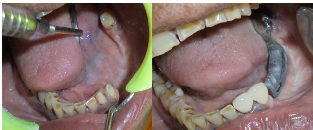
Fig. 3: Intraoral mandibular defect view with prepared abutments and Cemented metal framework