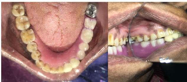
Fig. 4: Fixed removable Hybrid prosthesis insitu

supported metal frame work supporting removable partial dentures is an option that combines the advantages of fixed prosthesis (support, stability, and retention) removable prosthesis (esthetics and hygiene maintenance). 4