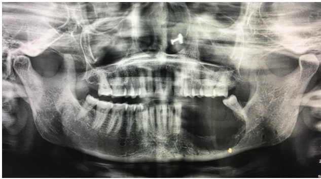
Fig. 2: Post Op OPG