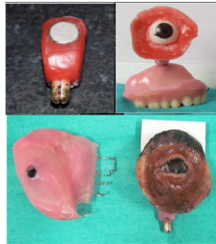
Fig. 4: Stage III Customization of the retentive attachment