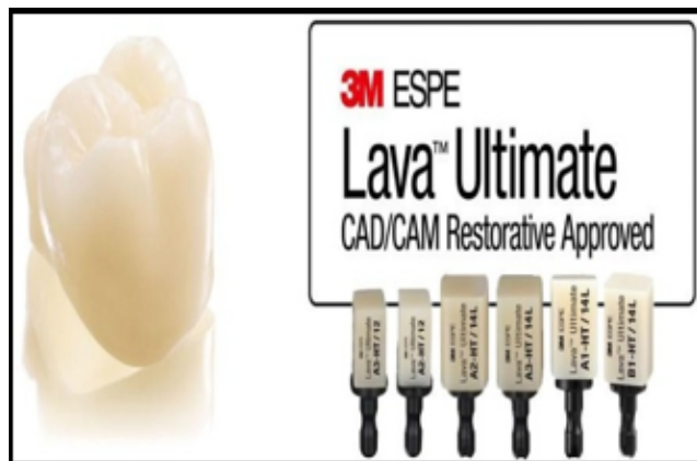
Fig. 2: Nano composites

in both modulus and strength. The addition of the functionalized nanoparticles has no deleterious effect on the thermal stability of the composite and the vinyl ester resin after curing has effectively protected the alumina nanoparticle from dissolution in both acidic and basic solutions. 37