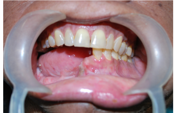
Fig. 1: Pre operative defect

measure for prevention of dental caries. Finished and polished cast partial prosthesis was delivered to the patient along with prescription of carboxy methyl cellulose (Wet Mouth, ICPA) salivary substitute (Figure 8). Patient was trained to fill salivary reservoir with salivary substitute before every meal as per comfort. Post insertion instructions were given to the patient.