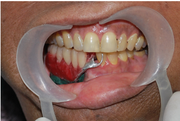
Fig. 5: Try-in