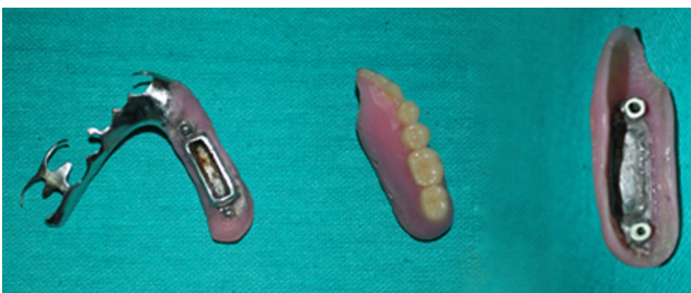
Fig. 6: Finished prosthesis