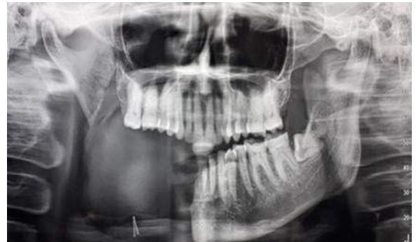
Fig. 2: OPG showing mandibular defect