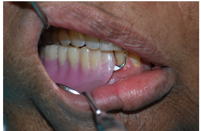
Fig. 8: Prosthesis In situ