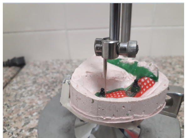
Fig. 3: Semi Precision Attachment