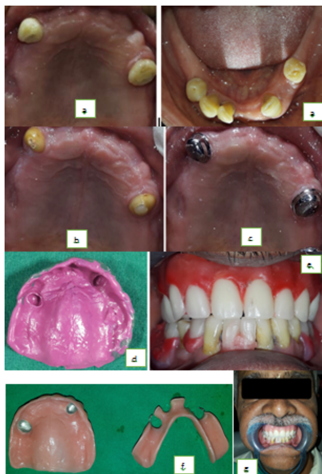
Fig. 1: a: Pre-op maxilla and mandible, b: Tooth preparation of 13,24, c: Cementation of metal copings, d: Final impression of maxilla, e: Wax trial in the patient, f: Completed maxillary and mandibular dentures, g: Maxillary overdenture with mandibular RPD insertion

Primary maxillary and mandibular impressions were made using irreversible hydrocolloid and casts were poured.