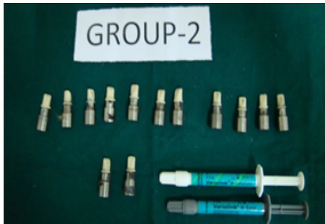
Fig. 4: Metal dies with zirconium oxide copings luted with Variolink II