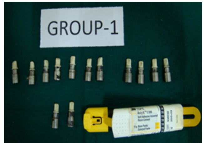
Fig. 2: Metal dies with zirconium-oxide copings luted with RelyX U100

Germany) which is a resin based luting cement (Figures 2 and 3).