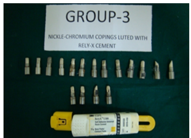
Fig. 3: Metal dies with nickel chromium copings luted using RelyX U100

The required amount of cement is dispensed onto a mixing pad and mixed using an agate spatula. The second cement used was Variolink II resin luting cement (Ivoclar Vivadent, Schann, Liechtenstein) (Figures 4 and 5).