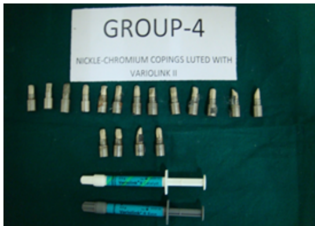
Fig. 5: Metal dies with nickel-chromium copings luted with Variolink II