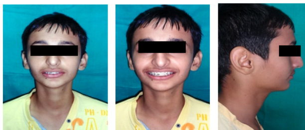
Fig. 6: Forsus in situ

Examination of the lateral cephalometric radiograph (Table 2) indicated skeletal Class II malocclusion and