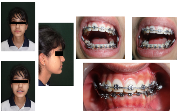
Fig. 2: Forsus in situ