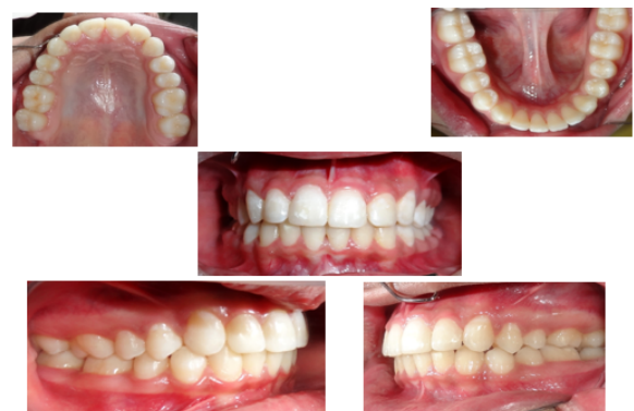
Fig. 7: Case-2 Post treatment

Cephalometric measurements indicated that maxillary incisors were labially inclined (U1-SN: 97° to 105°), and mandibular incisors were proclined from IMPA of 81° to 95°