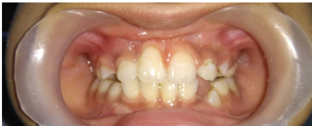
Fig. 6: Postoperative after 3 months.

In orthodontic extrusion, tooth movement is based on the principal of applying the tractional forces in all the regions of the periodontal ligament in order to stimulate marginal apposition of the underlying crestal bone. 6 As the gingival tissue is attached to the root by a connective tissue, so during the extrusion procedure, the gingiva follows the vertical movement of the root. 7 Similarly, the alveolus is attached to the root by the periodontal ligament, which is in turn pulled along by the movement of the root. 8,9