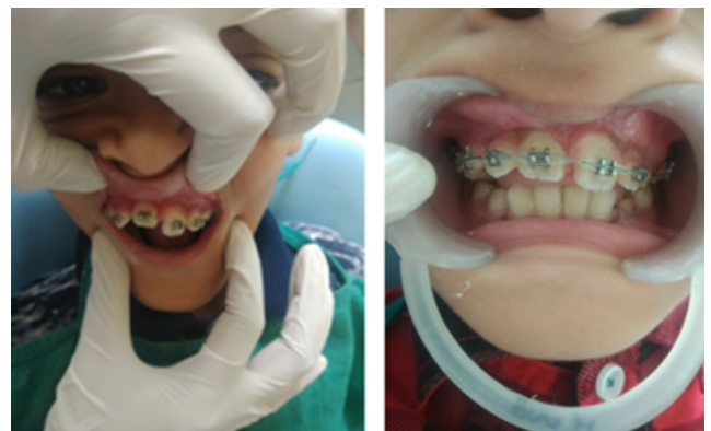
Fig. 4: Postoperative after 1 month.

Very few studies on tooth rotation have revealed about the amount or magnitude and direction of the rotations. Gupta et al. in his study classified the rotation of teeth into three groups: <45^\circ , 45-90^\circ and >90^\circ . He found that rotations were the most common (10.24%) abnormality among the entire sample size and further concluded that the bulk of the tooth rotations were between 45^\circ and 90^\circ , followed by <45^\circ rotations. The most commonly rotated teeth found were the mandibular second premolars, then followed by mandibular first premolars and maxillary central incisors with almost similar prevalence. 5