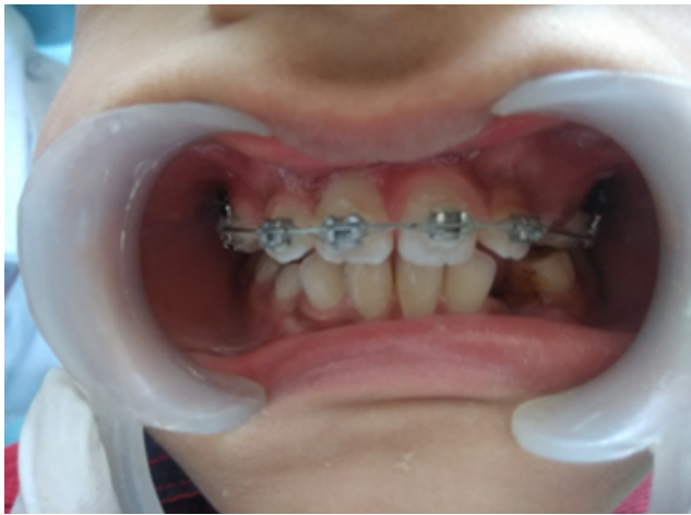
Fig. 5: Postoperative after 2 months.