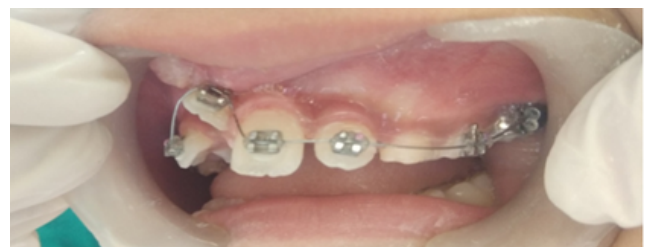
Fig. 3: Intraoperative bonding of anterior teeth.