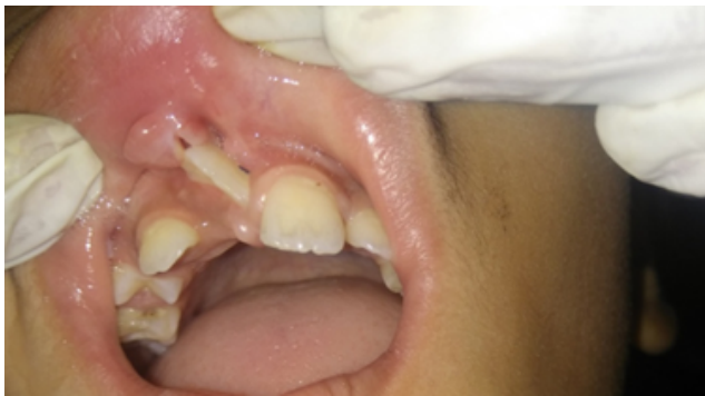
Fig. 1: Preoperative

A 10 year-old male reported to the department of pediatric and preventive dentistry with the chief complaint of ulceration on the inner side of the upper lip. Intra oral examination revealed a malposed right upper central incisor, placed high in the labial vestibule. The tooth was severely malaligned with the crown rotation of more than 90 degrees from normal. The palatal surface was facing labially and the root development was in the palatal plane. Considering the unfavourable position of the tooth, Orthodontic extrusion was the treatment planned. Banding of left and right maxillary permanent first molars was done. Bonding was done with 0.012" NiTi wire. Patient was followed up after every one month for 3 months.