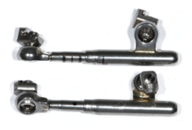
Fig. 1: PowerScope Appliance

7. Allen key type to tighten the screws.