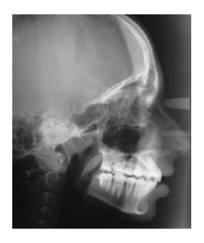
Fig. 7: Post-treatment lateral cephalogram.

A noticeable mandibular advancement was seen as considerable reduction of 4^{\circ} was observed in ANB angle from 6^{\circ} to 2^{\circ} post treatment, SNB angle increased from 74^{\circ} to 78^{\circ} , Beta angle improved from 26^{\circ} to 29^{\circ} and 4mm of improvement was seen in Wits appraisal also there was increase in mandibular length by 3mm, though no changes were observed in maxillary length after PowerScope appliance correction. Mild reduction in proclination of maxillary incisors was observed whereas mandibular incisors proclined by 4^{\circ} angular and 2 mm linear (i.e. L1-NB : 29^{\circ} ,7mm) after correction via PowerScope (Figure 7).