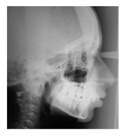
Fig. 4: Pre-treatment lateral cephalogram.

Lateral cephalogram and its tracing showed a convex skeletal profile. ANB angle of 6^{\circ} , SNA- 80^{\circ} , SNB- 74^{\circ} along with a retrognathic mandible and a relatively normal positioned maxilla. An average growth pattern can be suggested from a normal mandibular plane angle of 25^{\circ} . Dentoalveolar readings indicated a mild retroclined mandibular anteriors and proclination of upper anterior teeth (Figure 4).