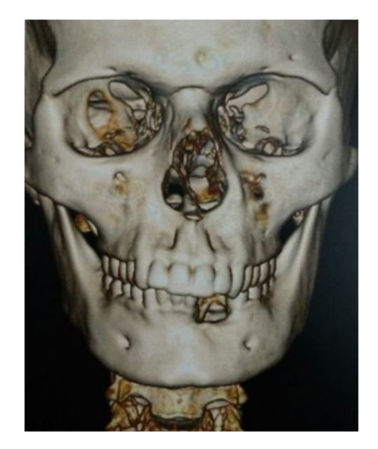
Fig. 2: 3D Reconstruction of computed tomography scan showing bone involvement

Histopathological diagnosis of ameloblastic carcinoma is difficult especially when it arises denovo and it should be differentiated from primary intraosseous squamous cell carcinoma, high grade mucoepidermoid carcinoma and other metastatic carcinomas of jaw. Therefore