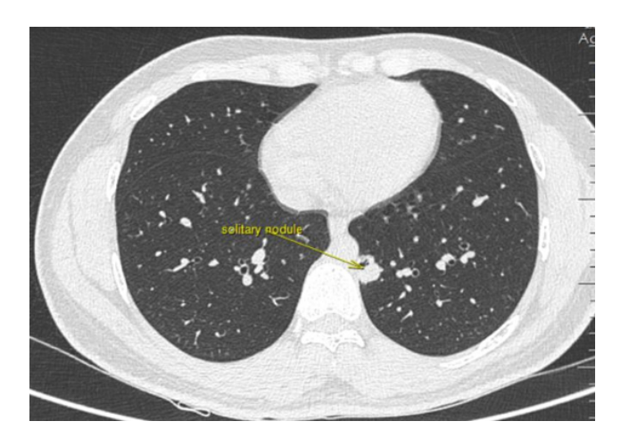
Fig. 3: HRCT chest showing cavitating solitary nodule in the lung

histopathological features of ameloblastoma like peripheral palisading, reverse polarity and stellate reticulum like structure in the background of anaplasia and frequent mitotic figures provide clues in diagnosis of this entity.<sup>12</sup> Treatment of choice would be curative intent surgical resection with wide margins, determined by site and extent of tumour. There are a very few reports comparing surgery, radiation and chemotherapy. A systematic review of 153 cases to identify prognostic factors has shown that surgery with or without neck dissection (140.134 months, 95%CI 106.247–174.02) is the best primary modality of treatment. Radiotherapy (17.5, 95%CI 2.948–32.052) or chemotherapy (8 months, 95%CI 8 to 8) alone was not effective. The survival analysis has shown no benefit of additional treatment such as radiotherapy or chemotherapy.