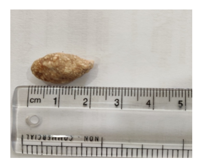
Fig. 2: Tonsillar stone after excision

and retention of epithelial debris. This epithelial debris form the ideal media for the growth of bacteria, actinomyces and fungi such as leptothrix buccalis. Finally dystrophic calcification occur as a result of deposition of inorganic salts from salivary secretions, other hypothesis is calculi located in peritonsillar area, the formation of calculi is secondary to salivary stasis within minor salivary glands or calcification of absecessified accumulation.