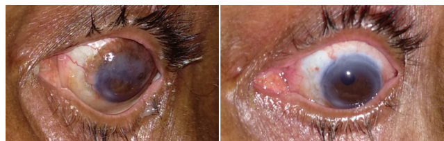
Fig. 3: These figure showing dual finding of squamous cell carcinoma and malignant melanoma which was treated with surgical excision + MMC.