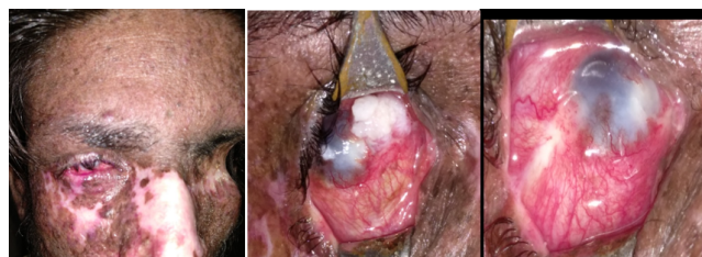
Fig. 1: These figure showing OSSN in xeroderma pigmentosa: Invasive squamous cell carcinoma showing diffuse leukoplakic mass at two sites and extensive feeder vessels, treated with 0.04% MMC without surgical excision resulted in completely resolution after 4 cycles.